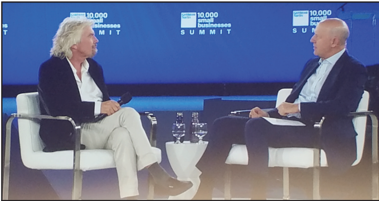
Sir Richard Branson is an English business magnate, investor and philanthropist. He founded the Virgin Group, which controls more than 400 companies.