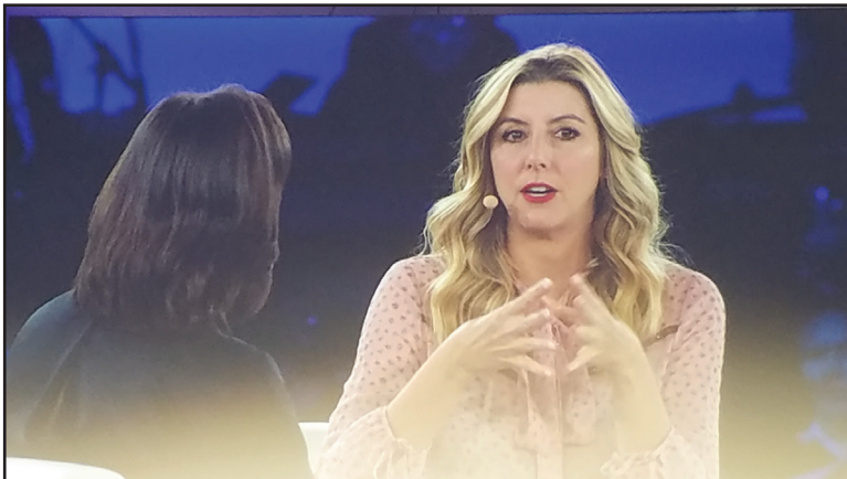
Sara Blakely is an American billionaire businesswoman, and founder of Spanx, a hugely successful intimate apparel company with pants and leggings founded in Georgia.