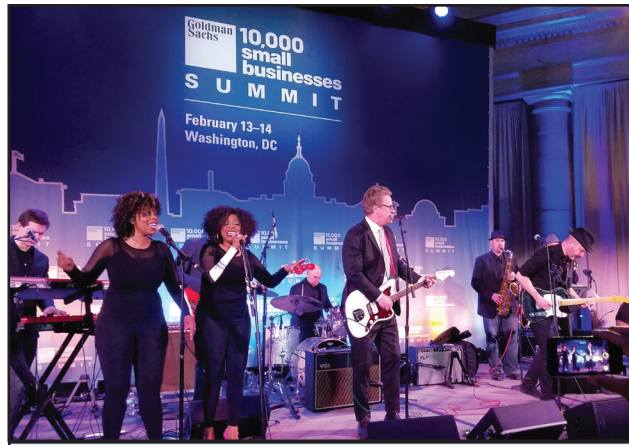
Former congressman and MSNBC host of Morning Joe, Joe Scarborough, provided musical entertainment for the party at Union Station to end the first day at the Summit, but not before special guests Goldman Sachs CEO, Lloyd Blankfein, Former Mayor Of New York City, Michael Bloomberg, and Treasury Secretary Steve Mnuchin took the stage and shared a few thoughts with the audience.

This story echoes the concerns I shared with Rodney Davis's staff about how government over-regulation can create an unfair burden for small businesses that hinders growth. I emphasized that small