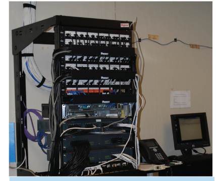
Our IT room designed by Computerease is optimized for climate control, prevention of flooding and centralized hardware.

Whatever the future advances in technology might be, Computerease's expertise is an asset that will help us remain on the forefront of technology so that we can continue to fulfill our commitment to the high quality, patient-focused medical care that our patients deserve.