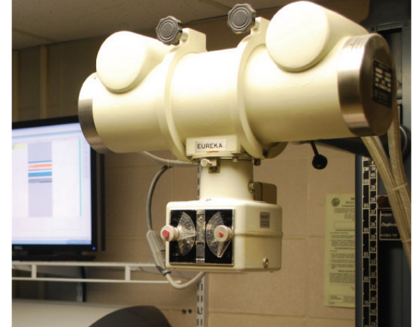
Patient records, X-rays, lab services and financial transactions are integrated with the computer system.

All of the Computerease staff explain the benefits and drawbacks of each of the options and makes a recommendation for what will work best, but I never feel pressured me to make a certain decision. I can easily make a well-informed and educated decision that best fits the needs of my business and my budget without having to spend hours of my valuable time researching on my own.